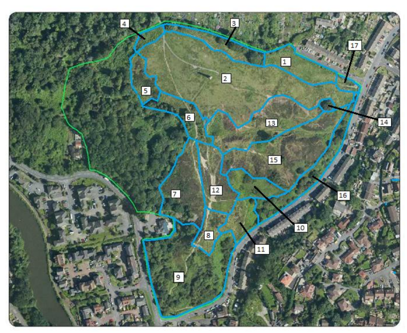
The hill has been divided into compartments of more or less homogenous vegetation, as shown on the above map. This section describes each compartment and sets out work guidelines for each.