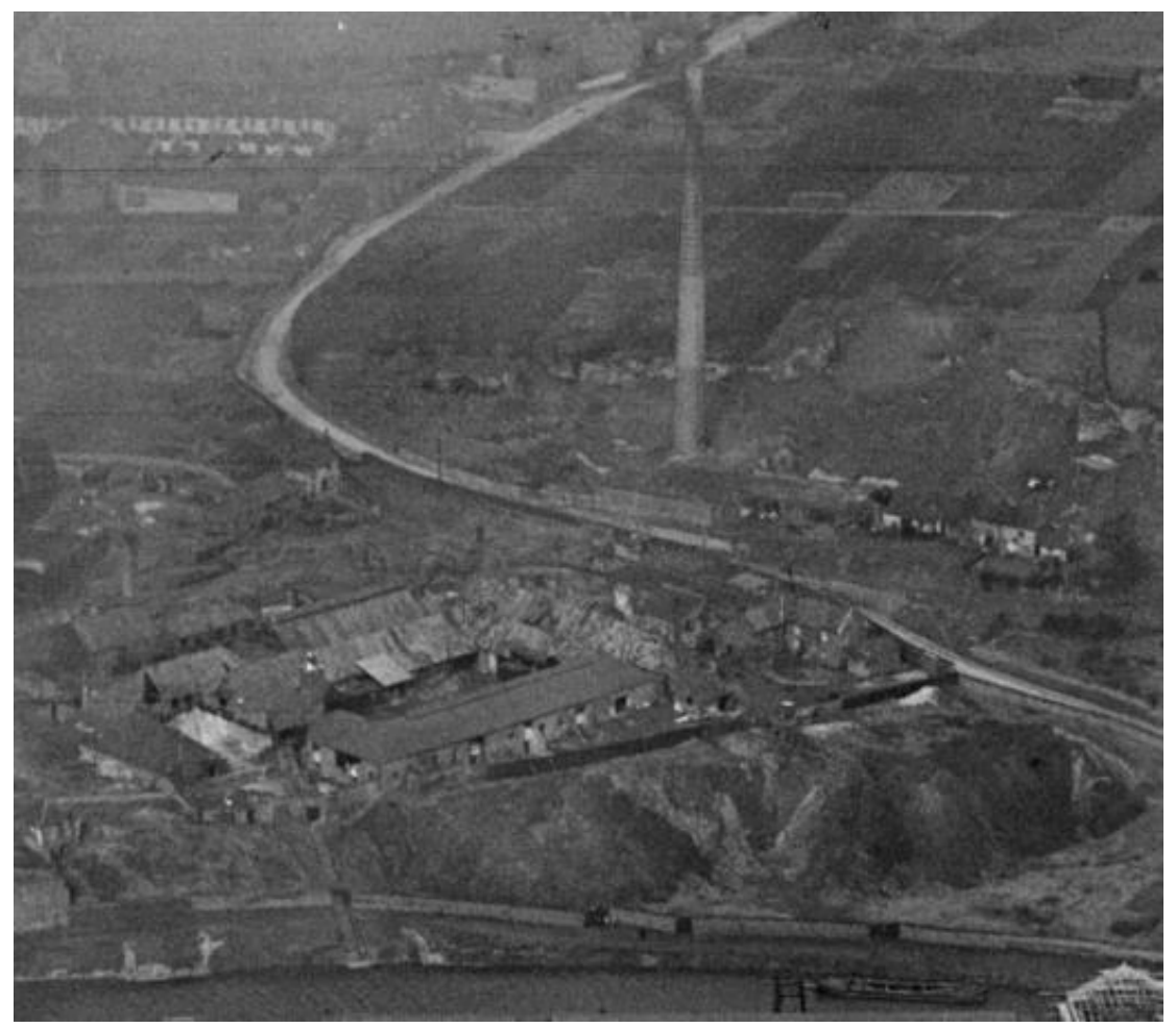
Blackswarth Leadworks and chimney, 1921 – image from the Britain from Above website.