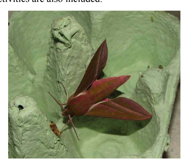
Elephant Hawk Moth photographed at the June 2005 Moth Evening